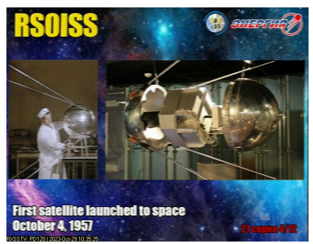
Sputnik. I was in HighSchool when...