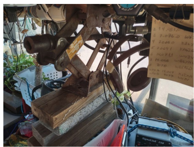
Jacking Up A Shelf of Books