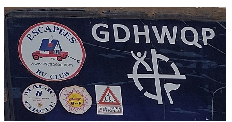
The Cat Drag'd Inn is a Travel Bug