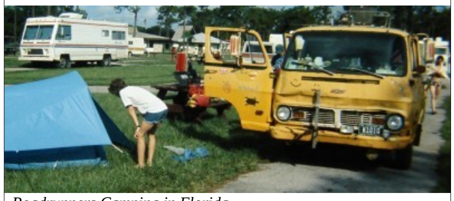
Roadrunners Camping in Florida

One thing " Willshedoit " did was play a part in an antinuclear protest at Seabrook, N.H. last year. While crowds of people and vehicles were turned away from the gate of the