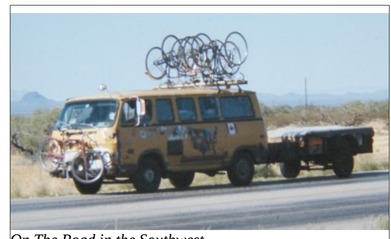
On The Road in the Southwest