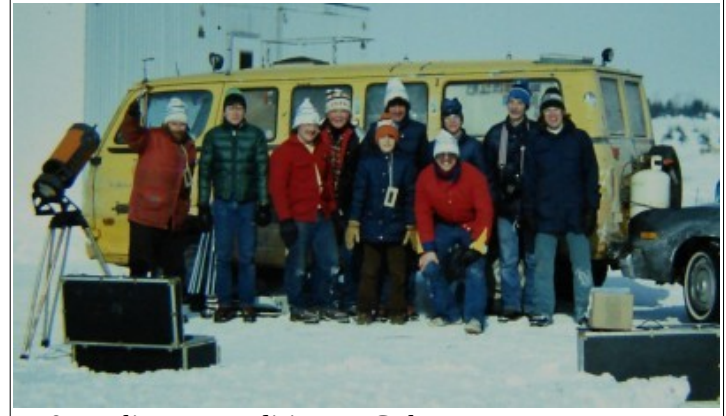
7902 Eclipse Expedition to Calgary

"It's got ten years left on it," he predicts, noting that the engine – it's third – is in good shape although "rust is a major problem." The