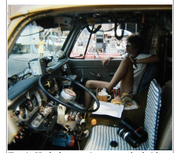
Travis Hodgdon, navigator on the bridge